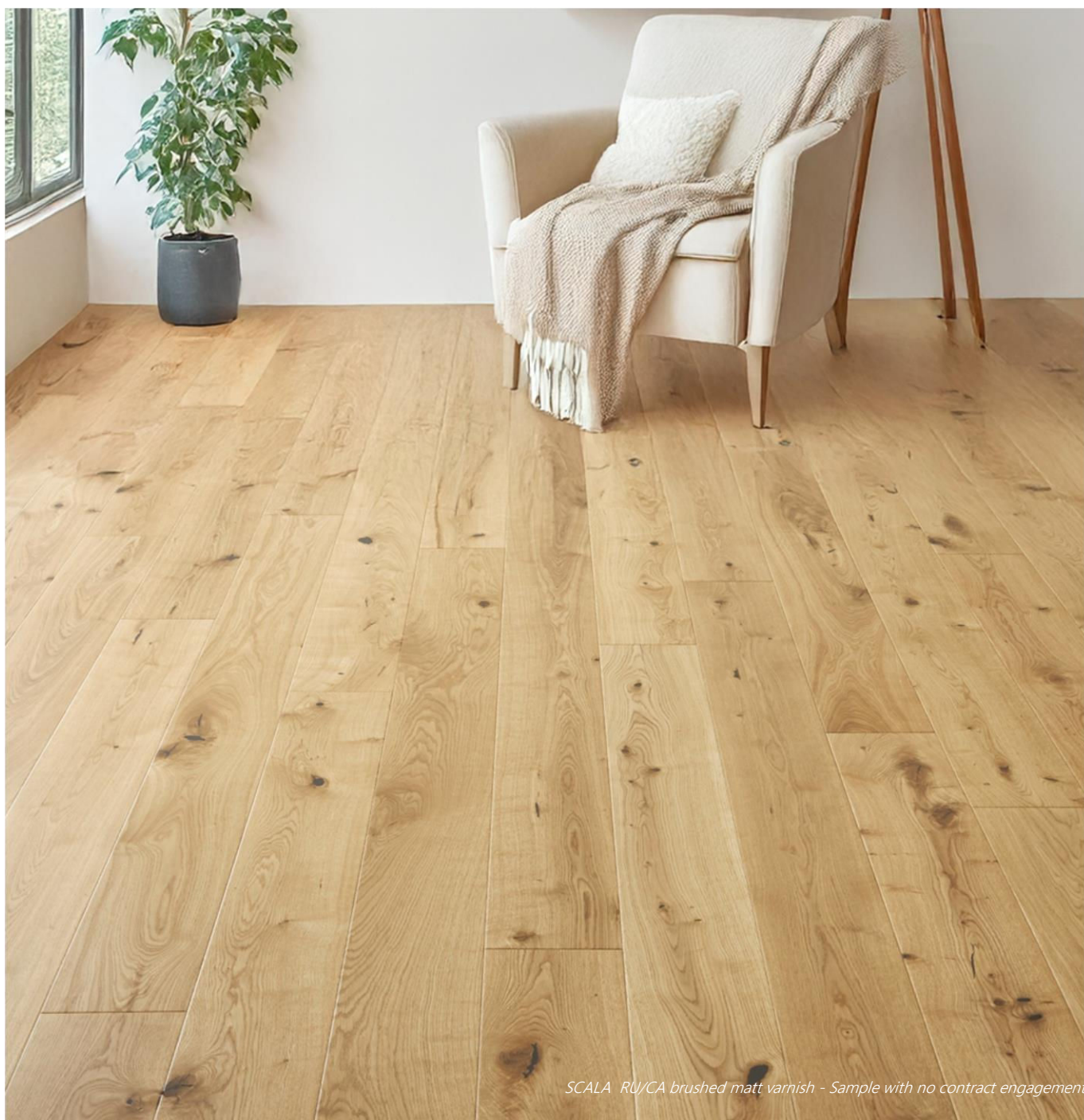
SCALA RU/CA brushed matt varnish - Sample with no contract engagement.