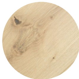
Colourless varnish (slightly bleached)