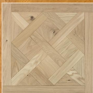
Versailles France or UK