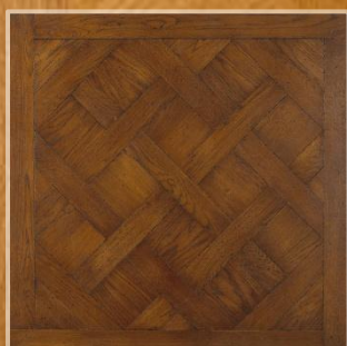
Large finishing possibilities