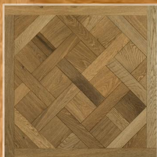
Thermo-treated / smoked or natural oak