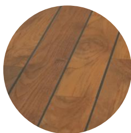
Pre-oiled Black integrated joint