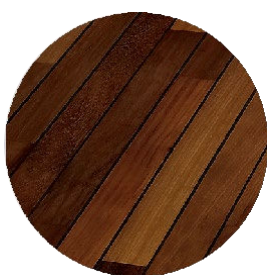
Pre-oiled Black integrated joint