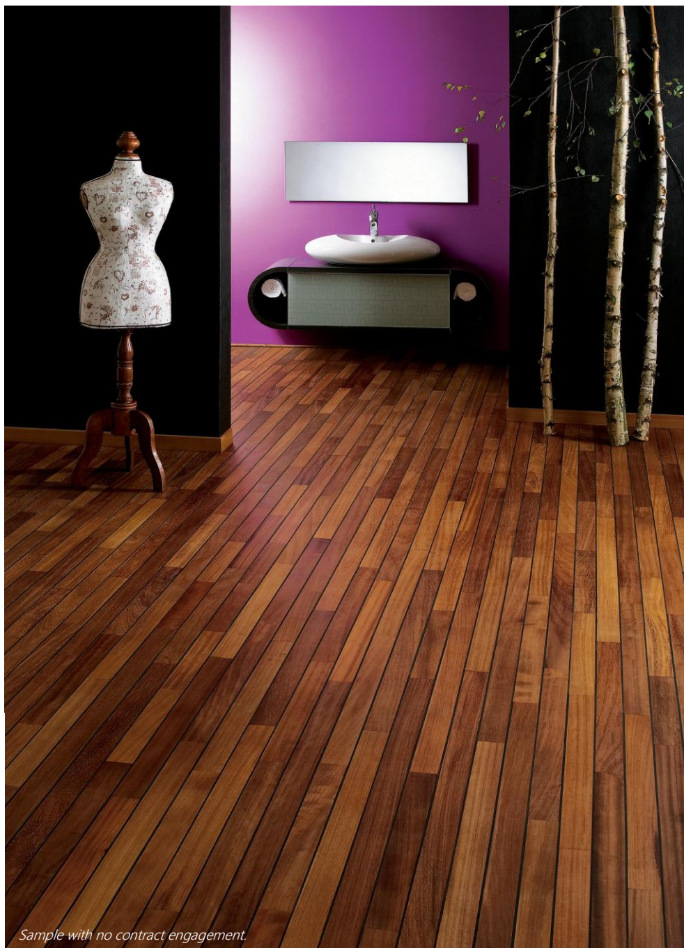
Sample with no contract engagement.

NAVYLAM+ is a unique system for easy and faster installation of "boat deck" flooring. The planks are already pre-oiled and have a built-in double joint. No more sanding, oiling or even laying joints, all you have to do is glue the tabs and fit the planks together to obtain a finished and perfectly waterproof parquet.