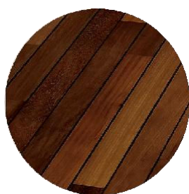
Pre-oiled Black integrated joint