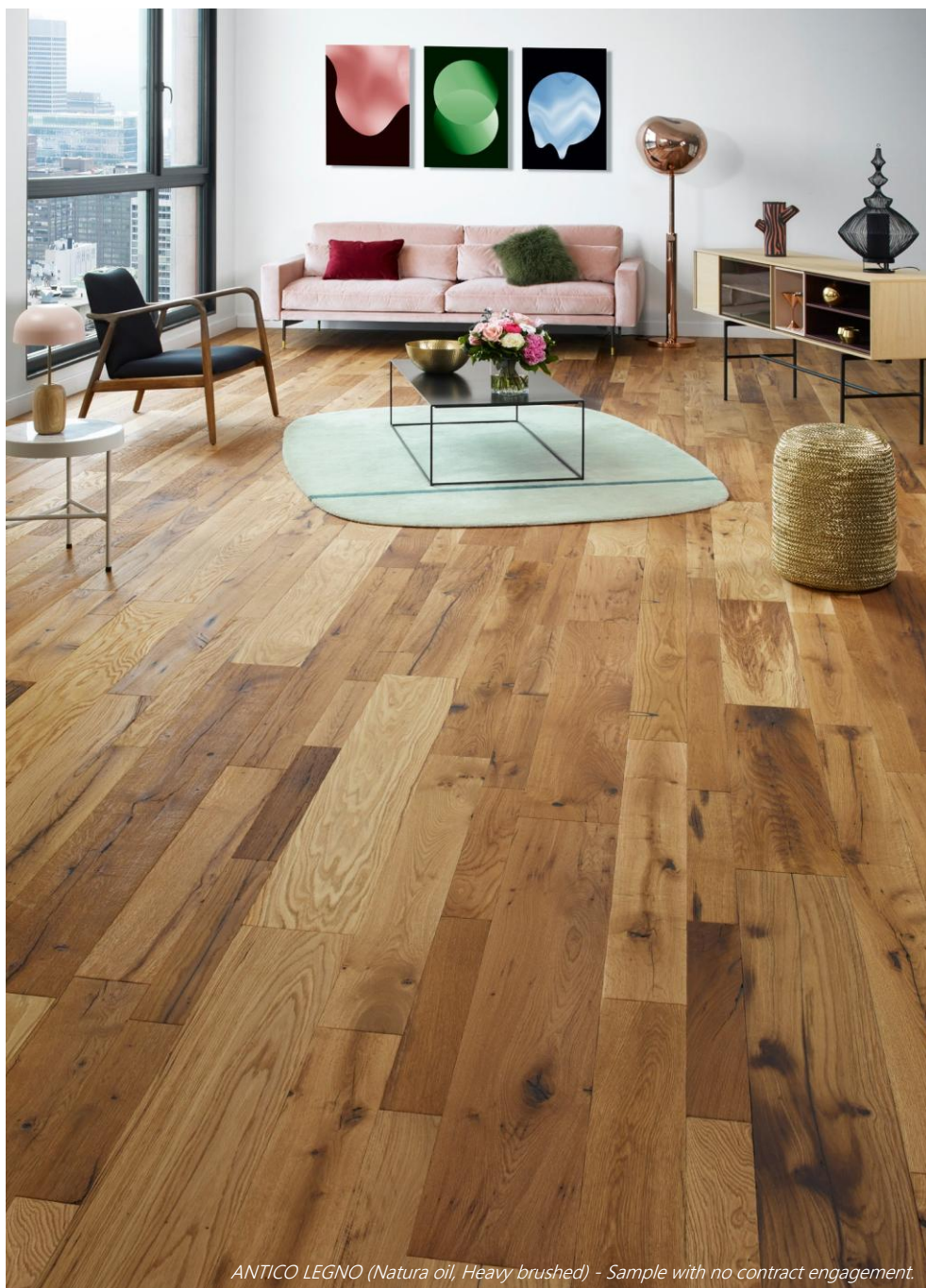
ANTICO LEGNO (Natura oil, Heavy brushed) - Sample with no contract engagement.