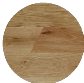
End's strip heavy brushed