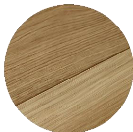
Very heavy brushed