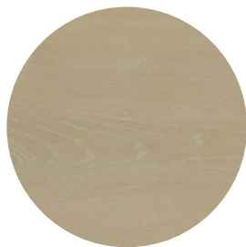
Bleached colourless varnish