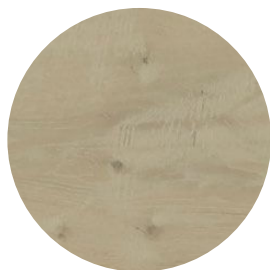
Band saw marks and hand shaved