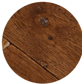
Knots not filled