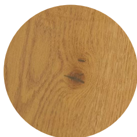
Knots and cracks