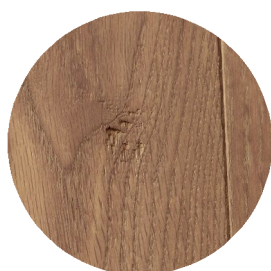
Marks and scratches