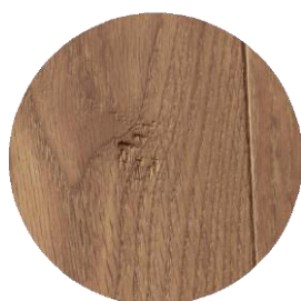
Marks and scratches