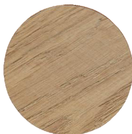
Light band saw marks