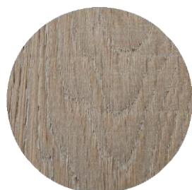
Band saw marks light