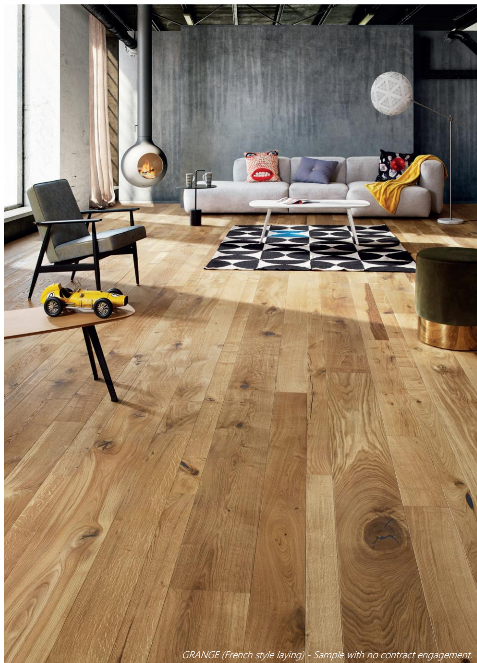
GRANGE (French style laying) - Sample with no contract engagement.