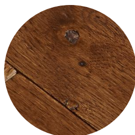
Knots not filled